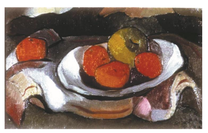
Fred Noyes, Tangerines, oil