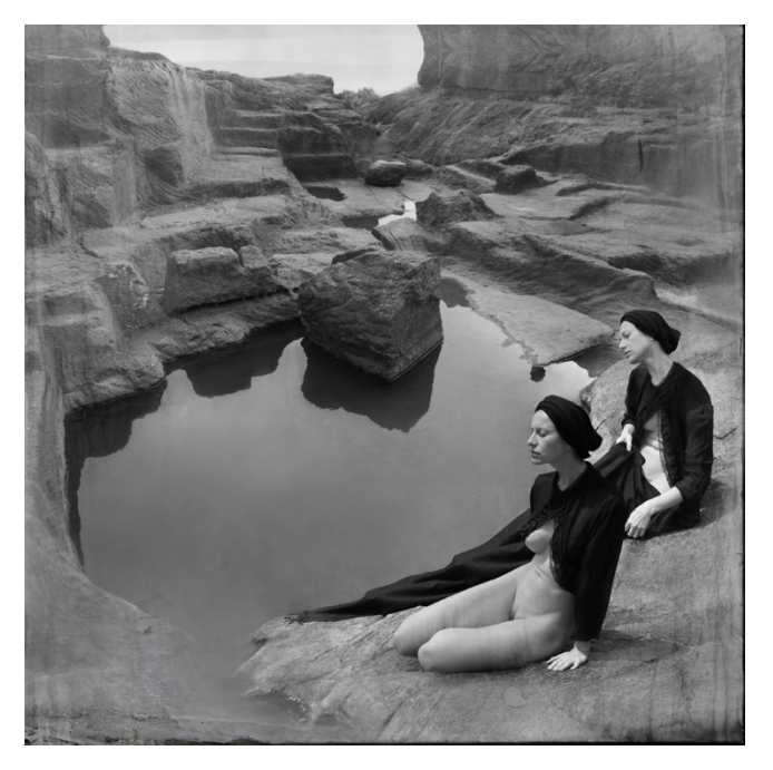
Untitled, giclée print, 2016

My artistic method is tracing and visualizing archetypes that manifest themselves across cultures and acts that are repeated across traditions. I do research of fears and desires stripped down to metaphysical shapes; human senses ragged by pain and hope, yet still hungry for experience and the mind worn out by duality of reason that is trying to come in terms with eternity and blurred definitions. There are two elements that I employ in my imagery - human being and one's surroundings.