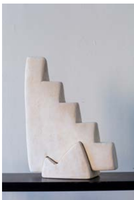
Fitzhugh Karol, Keynote

Process: Each clay body comes with its own limitations and abilities. Coarse clay made with lots of sand can support itself in ways porcelain cannot. The choices made during the formation and finishing of sculptures are in response to how the type of clay behaves. In high-fired reduction kilns, glazes and clays reveal their true potential. Finishes are tied to the atmosphere of the firing allowing for a large range of natural colors and blushing effects." https://www.curtisfontaine.com/