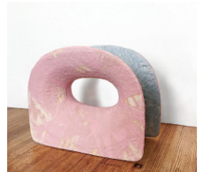
Geoff Booras, Pink (eyelet) Void , glazed ceramic, 2018