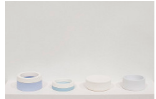
Yuichiro Komatsu, Minima II , 2017, White stoneware and earthenware with color stain

Yuichiro Komatsu's work is influenced by the simplicity and reductive nature of Minimalism. Komatsu explores the tactile nature of materials and the processes of making objects. One of the fundamental elements of ceramics is the notion of contained space. This space relates to the Japanese spatial concept of Ma , which can be roughly translated into "empty space" and shares the idea found in a "less is more" philosophy. Ma also refers to the simultaneous awareness of form and non-form and a particular consciousness of place. Thus, it can be extended further to suggest or imply an emptiness full of possibilities and a continuum, that spans both space and time. Komatsu's work is a search for forms and surfaces that work between the ideas of fragility and permanence through the pursuit of a palpable yet elusive idea of ephemeral beauty.