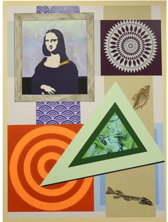
Sausalito Series 18