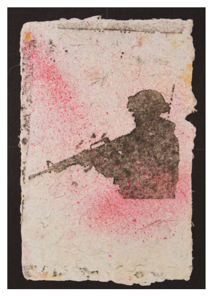
Scout, pulp print, anonymous

Dried sheets of paper become the platform for veterans to communicate their stories. Through instructional workshops, veterans integrate drawing, printmaking, and/or written words into their paper using various techniques. Whether it is a blank piece of paper or a created image on the surface, each work of art tells a story through the new language of papermaking.