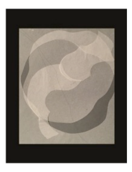
Anne Trauben, Number One (of 30) , 2017, paper collage, black gesso

Anne Trauben, curator and exhibitions director of Drawing