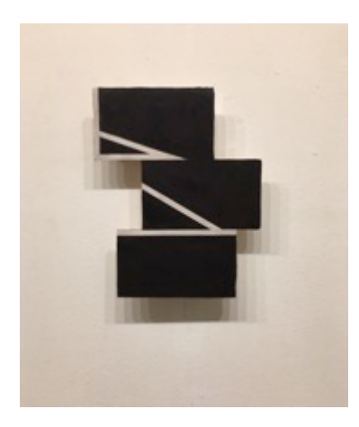
Bruce Halpin, Discrepancy , 2018, acrylic, wood

Alyce Gottesman grew up by a lake in New Jersey, where her fascination with energy and the seasons, as well as nature and music grew. Her abstract marks channel the vigor and patterns occuring in nature. Using both pale and bright hues, soft texture and energetic swipes of paint, she expresses a specific moment in time or evokes the structures of music and nature.