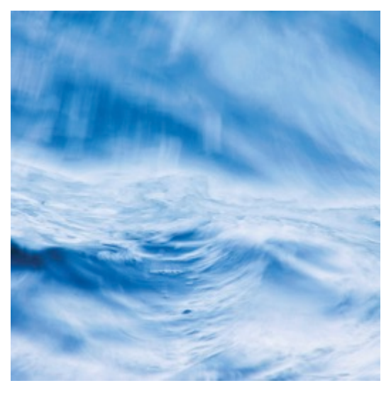
Alejandro Rubin, Abstract, photograph

Drawing Rooms, an art center located within a former convent in Jersey City, opened its doors in 2001 to contemporary artists from the New Jersey and New York metropolitan areas. The building houses twenty galleries, workspaces, and a gallery shop, offering a haven for artists to grow and continue their work. Drawing Rooms' mission is to link the community and its artists in meaningful cultural experiences.