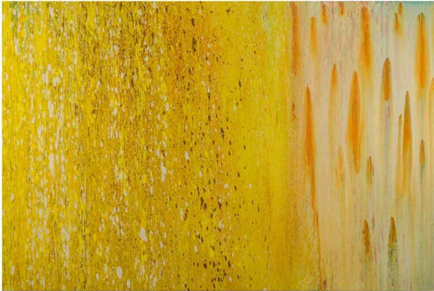
Stuart Lehrman, Sweet Corn , 2018, acrylic enamel and oil paint on wooden panel

Lehrman's complex creations are inspired by various art movements including Abstract Expressionism, Post-Painterly Abstraction, Color Field Painting, and Minimalism. He has tackled these ideas in other exhibitions as well. The ongoing series Road Rage is a continuation of the exploration of these concepts, with a photographer's lens instead of a paintbrush.