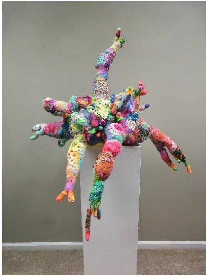
Rachel Udell, SS23 , lace and fabric