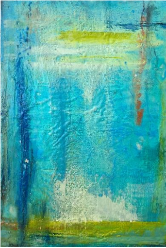
Sandra Koberlein, Of Land and Sea II , encaustic