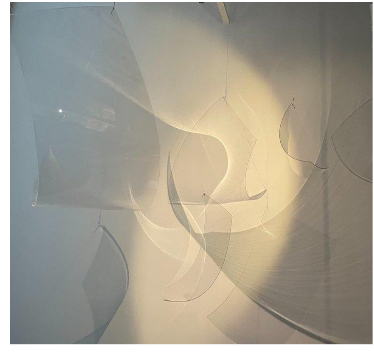
Jessica Judith Beckwith Entrainment June 15th, 2022 approximately 5' x 4' footprint led lights, 3 formed lenax sculptures, ball bearing hooks, monofilament, motors

"My work is the embodiment of light and rhythm. It is the sensation of sound and levity. Entrainment is a phenomena in physics in which two bodies vibrating at different rhythms begin to move at the same rhythm in concert with one another. The research for this piece developed out of a study of interconnection and the impact a body and its nervous system has on its environment and the environment on the body. I use projection and light as metaphors to examine points of interconnection between the universal and the individual. Influenced by my background in the theater, I activate the senses through light, sound, collaged video projection and rhythm seeking a felt space of embodied knowledge and connection."