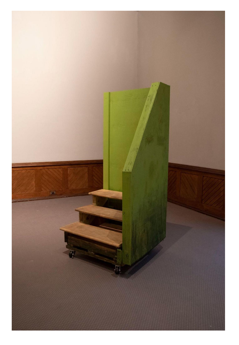
Neill Catangay Tatay 9" x 38" x 36" wood, acrylic, sand, ink, wheels

"Using materiality and Lo-fi methods, I create work that explores relationships between found objects and personal memory creating a rhythm of collaboration between the two to explore human and object histories that present a variety of futures. I use these materials as a voice to speak about various issues of colonialism, classism, and consumerism as well as the importance of memory and place within these -ism's. Growing up in Guam, a territory of the United States, my sense of place and identity as Filipino, American and Guamanian created a need for exploration of personal and projected histories. Specific areas - such as my grandparent's home that I was raised in and that was recently demolished - act as catalysts to open up various conversations about place and identity. I would often find objects in the jungle and imagine them as something else. Seeing objects outside of their expected context created an opportunity for new possibilities both physically and conceptually. My work uses these flows and fluctuations of material voices to create objects that invite remembrance, speculation and future possibilities."