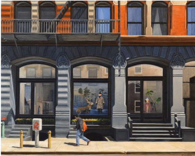
Nick Savides, On Howard Street , oil on linen, $2,000

painter who has an affinity for creating symbolic portraits of historic architecture, scenic landscape paintings, and still life images. His choice of imagery is based on his sense of deep appreciation for nostalgia, including both objects and places, and desire to bring a renewed sense of attention to these objects.