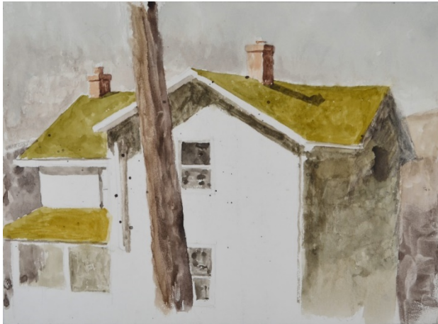
Ted Walsh, Green Roof , watercolor on paper

painter is to highlight “the significance of man’s connection with the Creator and His creation” while exploring a variety of vantage points to create believable paintings. The juxtaposition of a distant landscape and intimate aspects of the visual world, such as human or architectural elements, are frequently shown in his paintings with the intention of creating an exciting dichotomy between close and far.