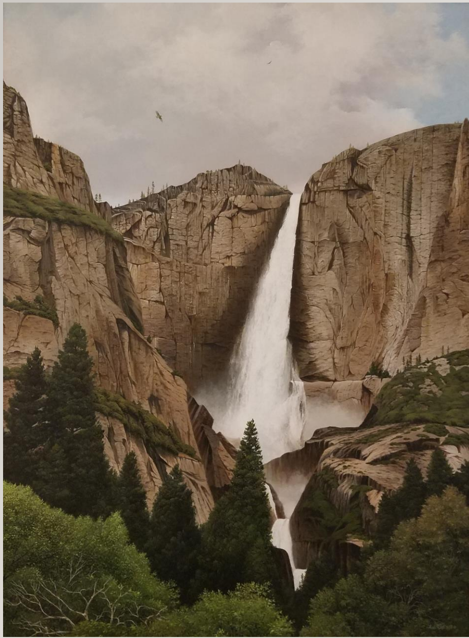
A.J. Rudisill Yosemite Falls Acrylic on panel 40" x 30"