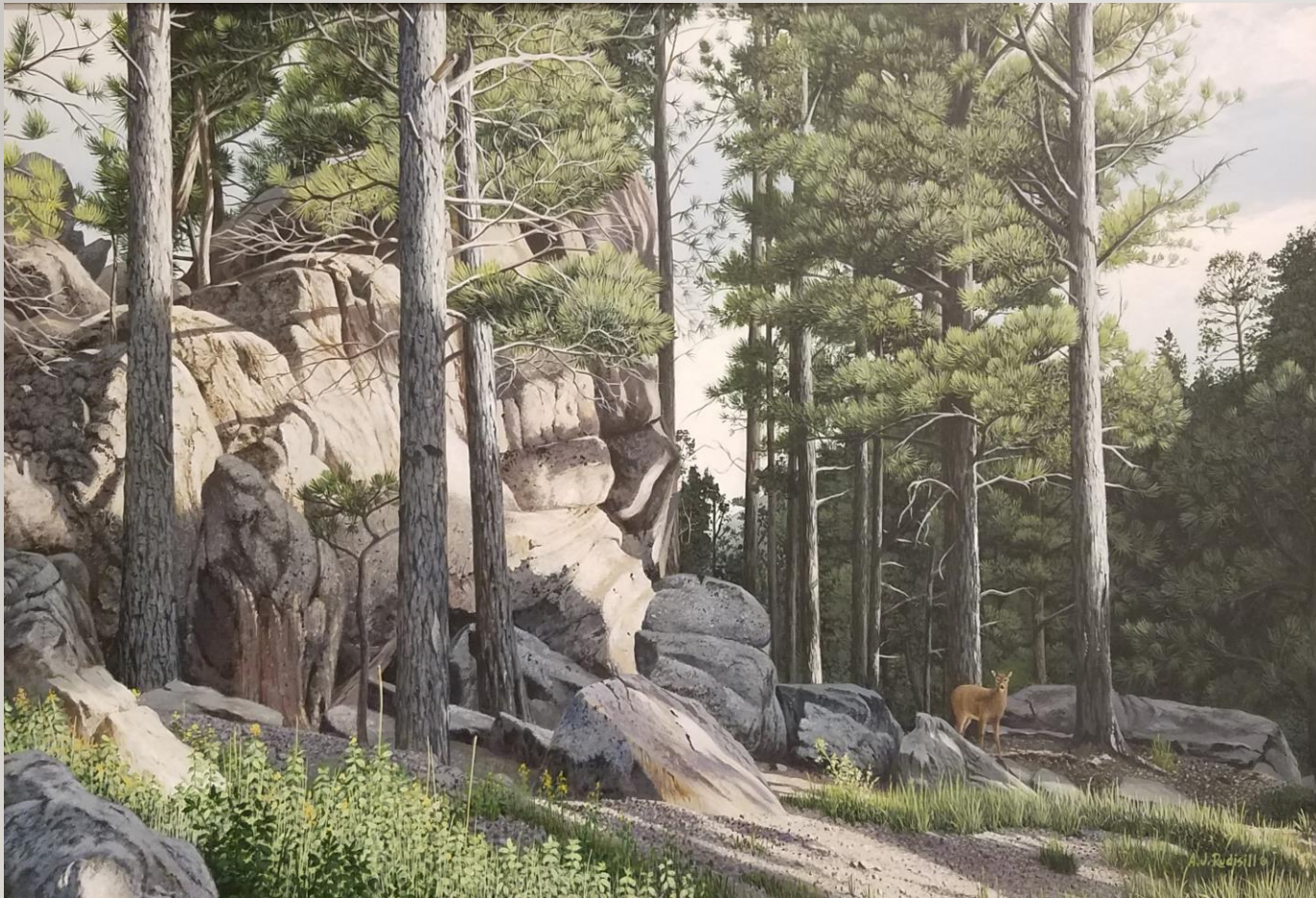
A.J. Rudisill Black Hills Forest at Mt. Rushmore Acrylic on panel 18" x 26"