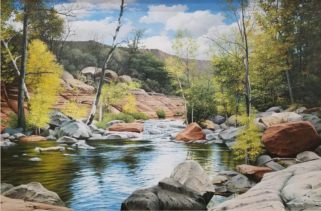
A.J. Rudisill Oak Creek Canyon/ Coconino National Forest AZ Acrylic on panel 20" x 30"