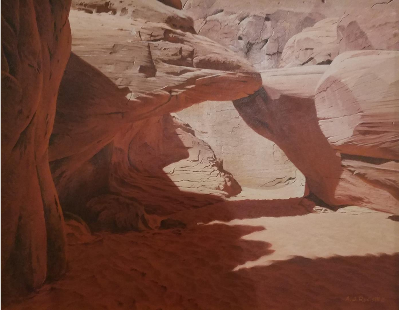
A.J. Rudisill Dune Arch/ Arches National Park UT Acrylic on panel 16" x 20"