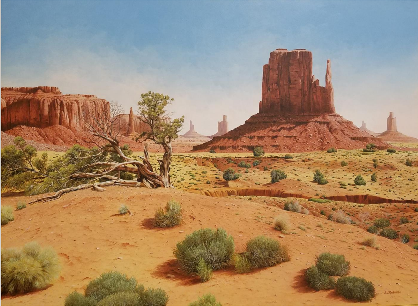
A.J. Rudisill Monument Valley Acrylic on panel 30" x 40"