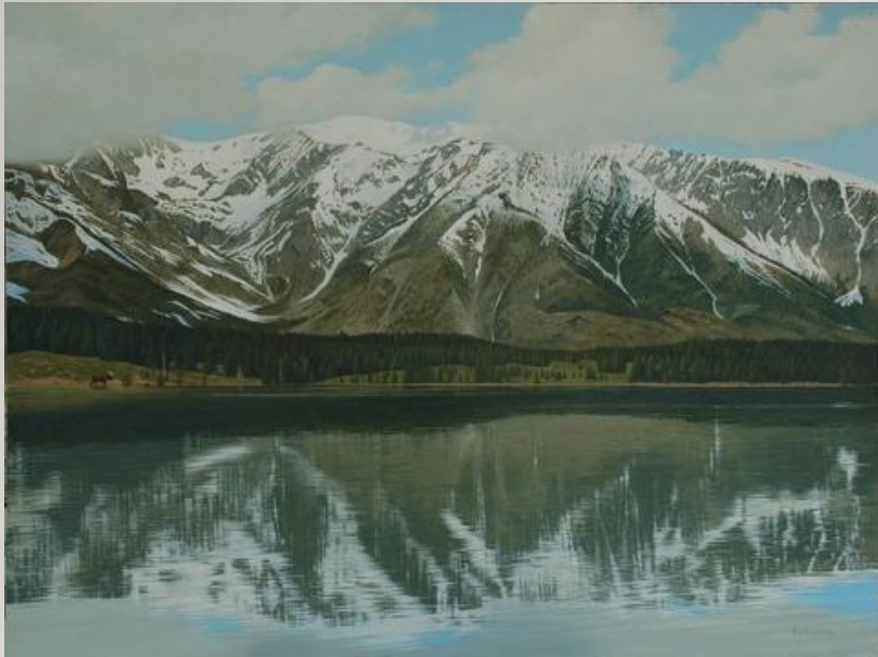
A.J. Rudisill Jackson Lake/ Grand Tetons National Park WY Acrylic on panel 30" x 40"