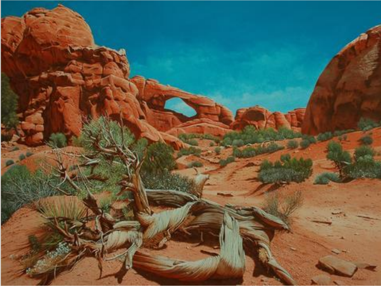
A.J. Rudisill Skyline Arch/ Arches National Park UT Acrylic on panel 30" x 40"