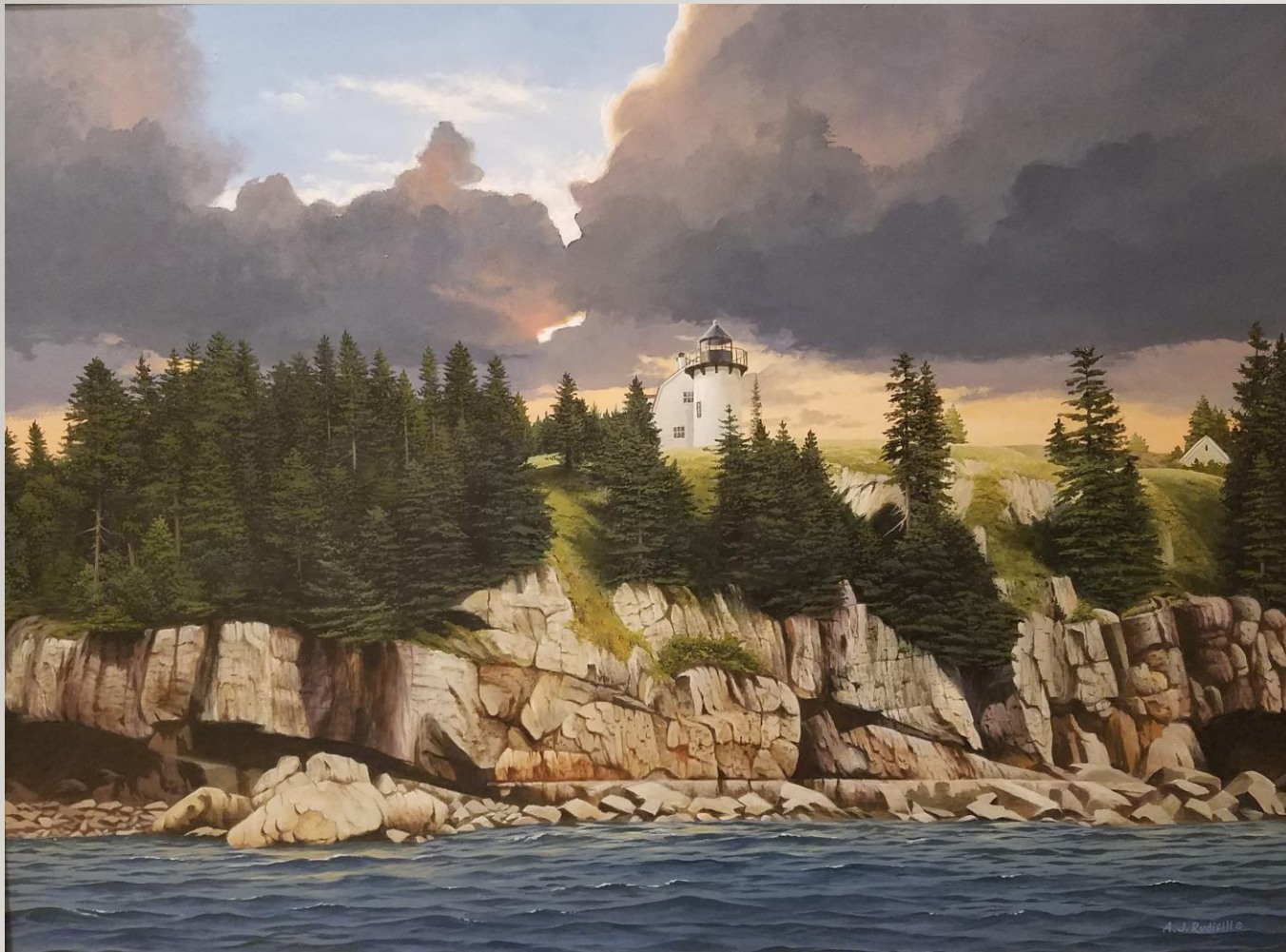
A.J. Rudisill Bear Island Light/ Acadia Acrylic on panel 22.5" x 30"