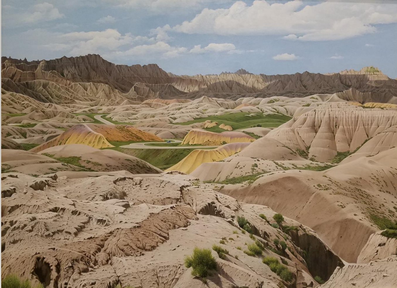
A.J. Rudisill Badlands National Park SD Acrylic on panel 30" x 40"