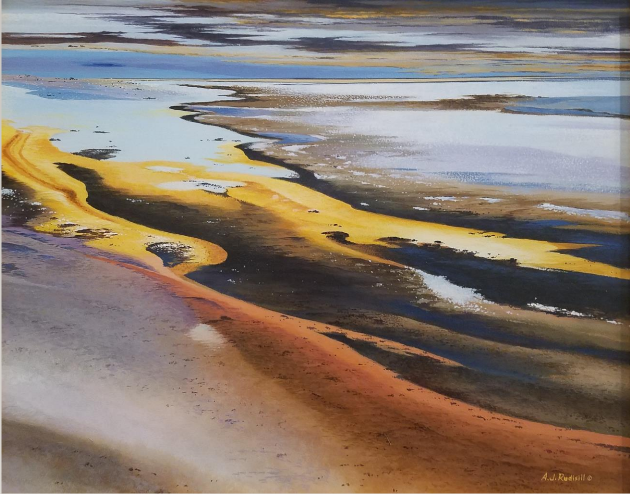
A.J. Rudisill Black Sand Basin/ Yellowstone National Park WY Acrylic on panel 16" x 20"