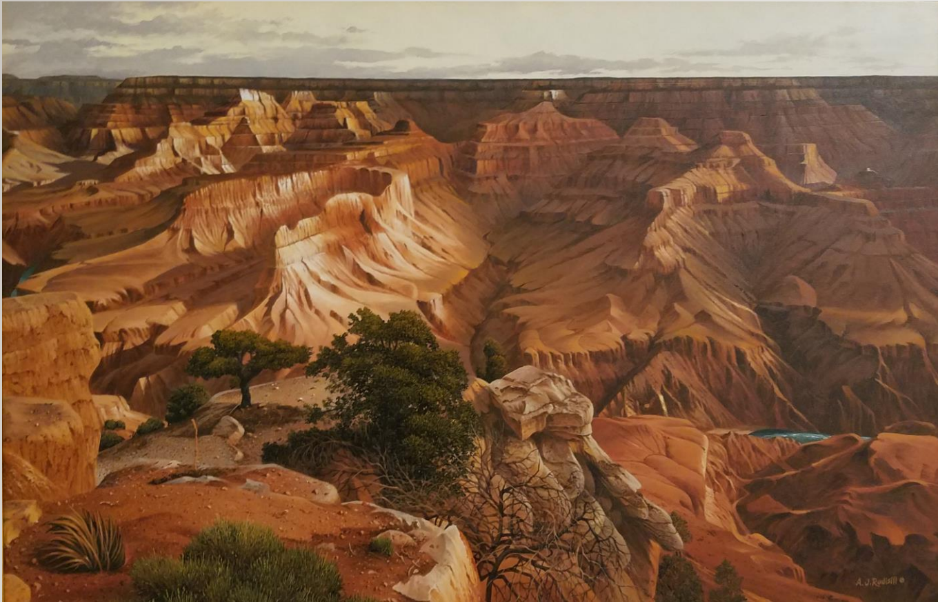
A.J. Rudisill Grand Canyon Splendor Acrylic on panel 20" x 30"