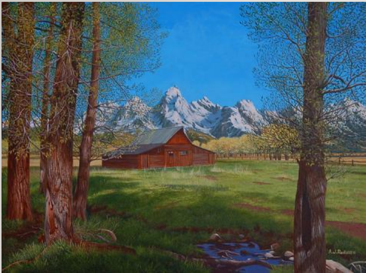
A.J. Rudisill Mormon Barn/ Grand Tetons National Park WY Acrylic on panel 18" x 24"