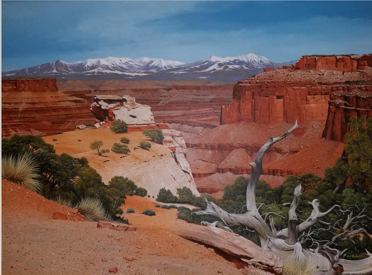
A.J. Rudisill Shafer Canyon Overlook/ Canyonland National Park UT Acrylic on panel 30" x 40"