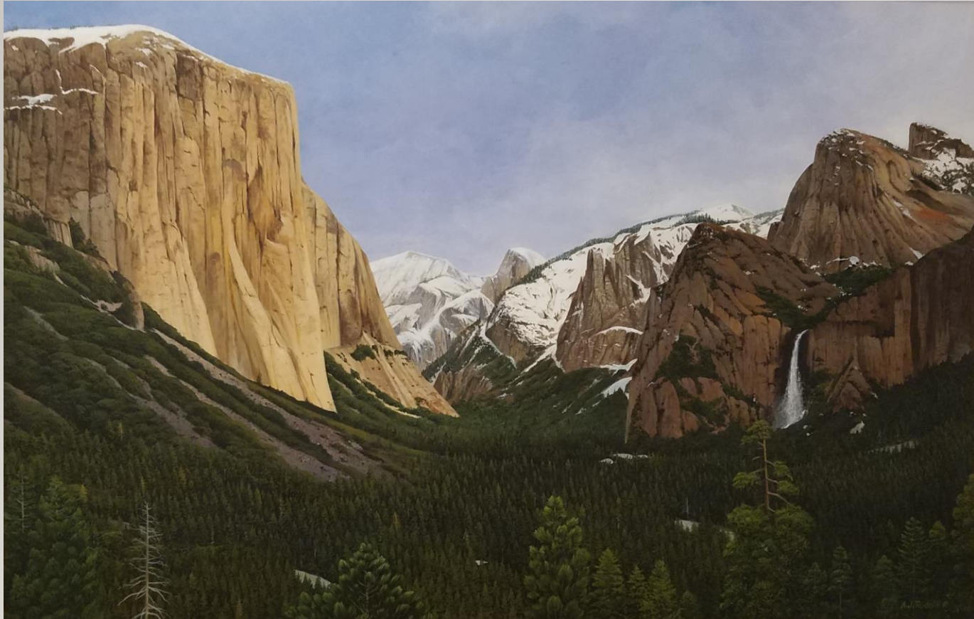
A.J. Rudisill Yosemite Valley Acrylic on panel 24" x 36"