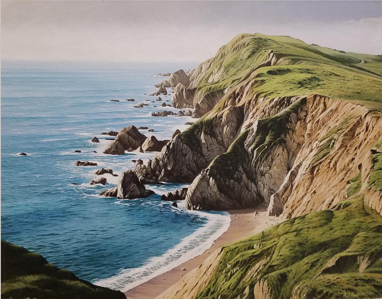
A.J. Rudisill The Cliffs of Point Reyes/ Point Reyes National Park CA Acrylic on panel 16" x 20"