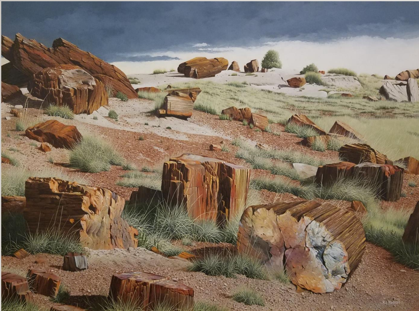
A.J. Rudisill Petrified Forest National Park AZ Acrylic on panel 30" x 40"