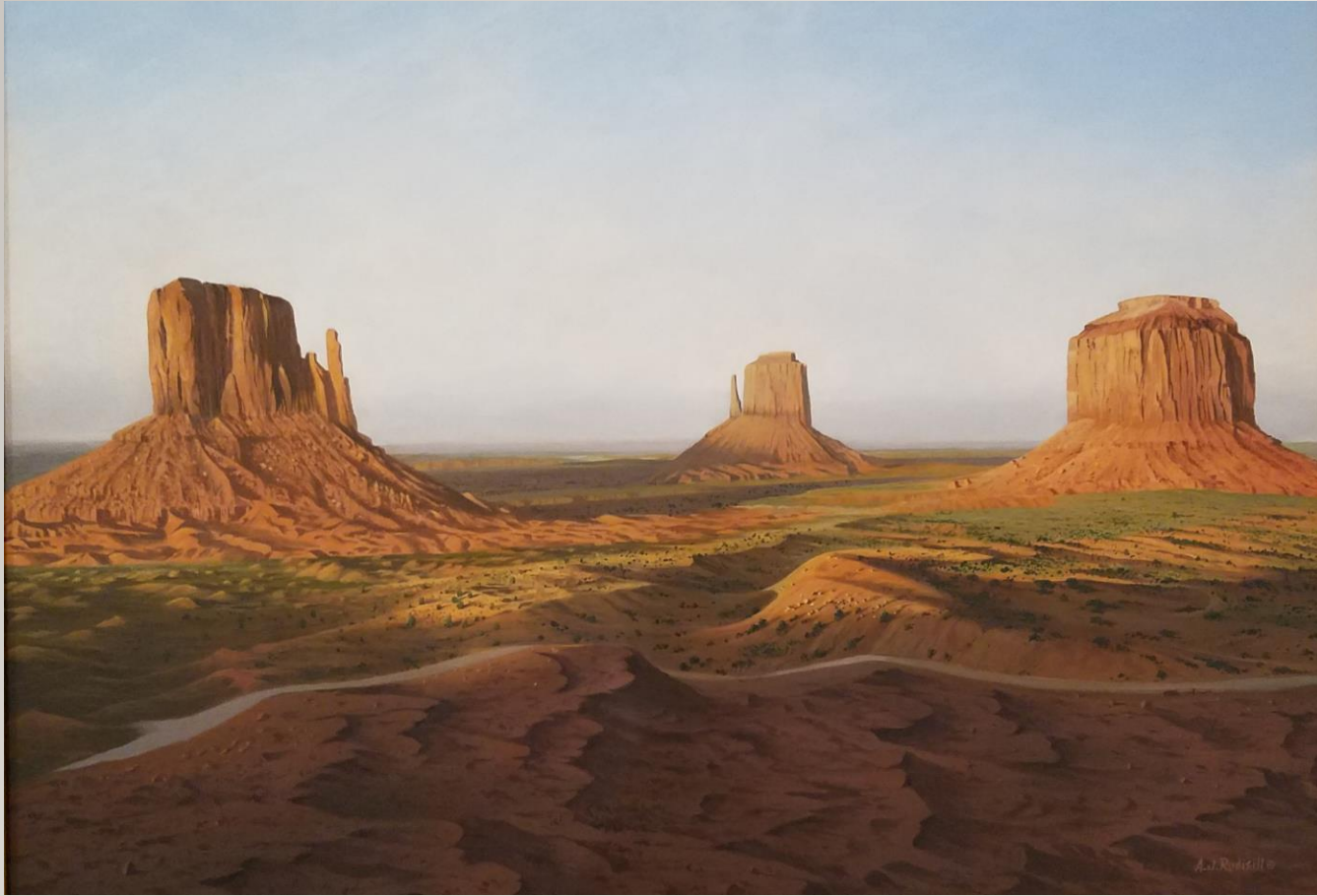
A.J. Rudisill Monument Morning Acrylic on panel 18.5" x 25.5"