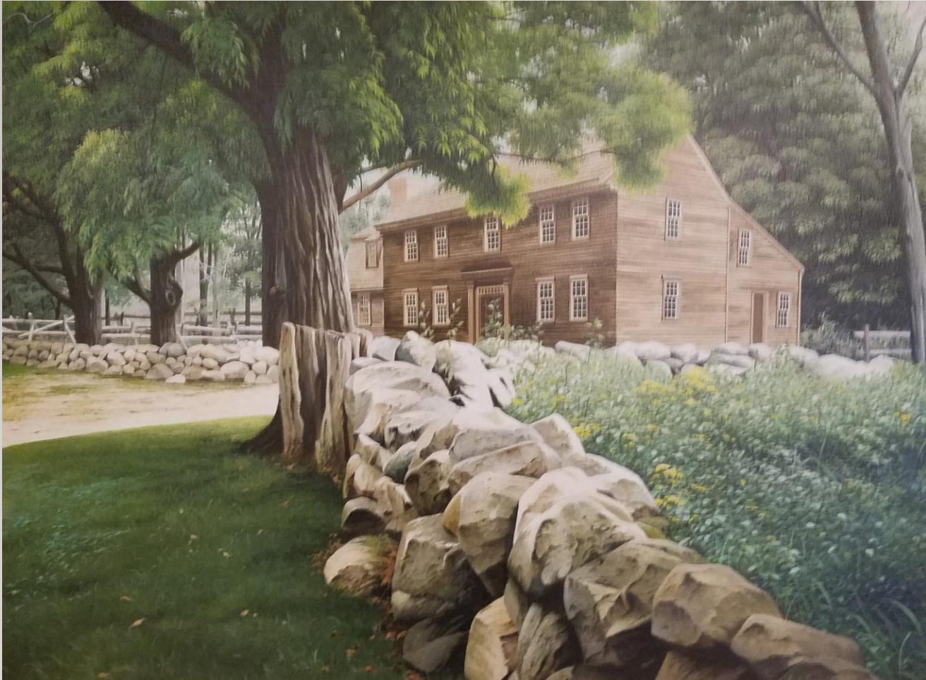
A.J. Rudisill The Hartwell Tavern Acrylic on panel 18" x 24"