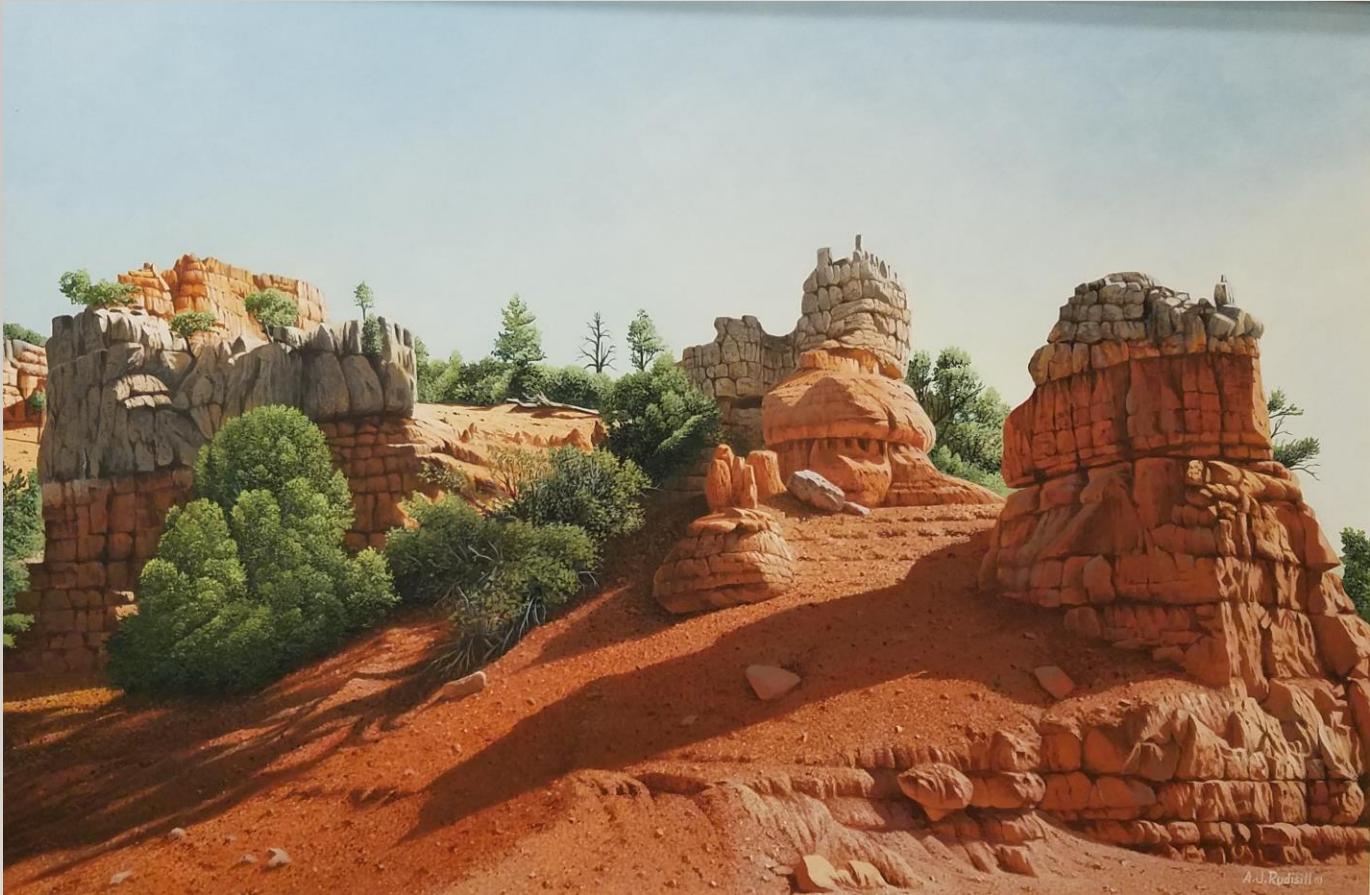
A.J. Rudisill Entering Red Canyon Acrylic on panel 20" x 30"