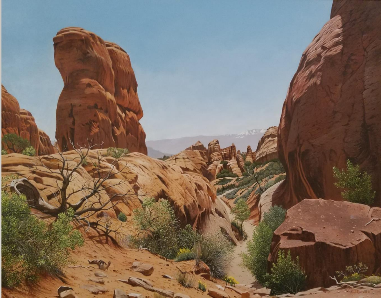
A.J. Rudisill Trail to Landscape Arch/ Arches National Park UT Acrylic on panel 24" x 30"