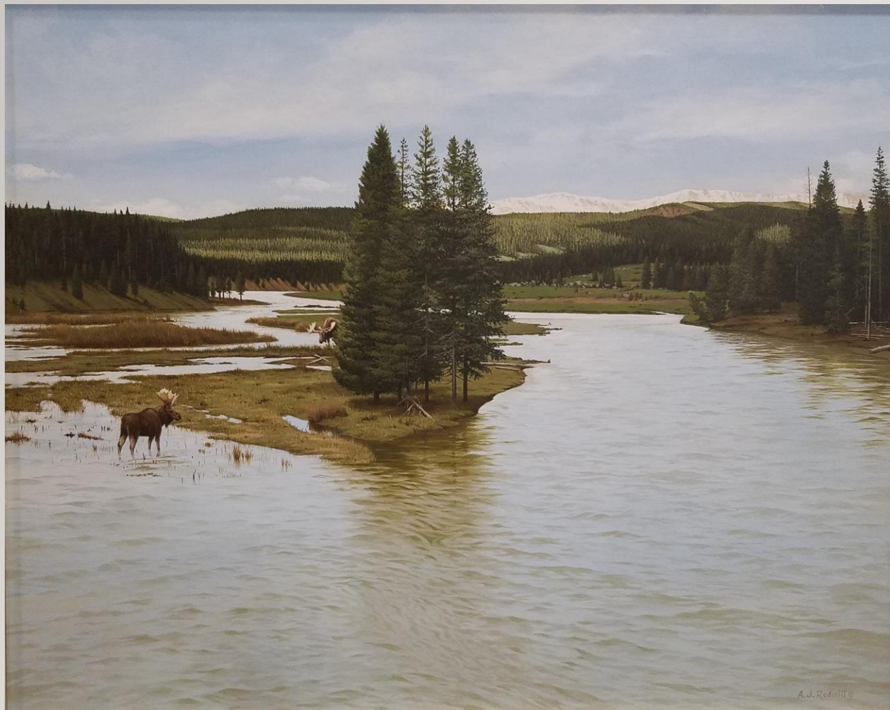
A.J. Rudisill The Grand Tetons Acrylic on panel 24" x 30"