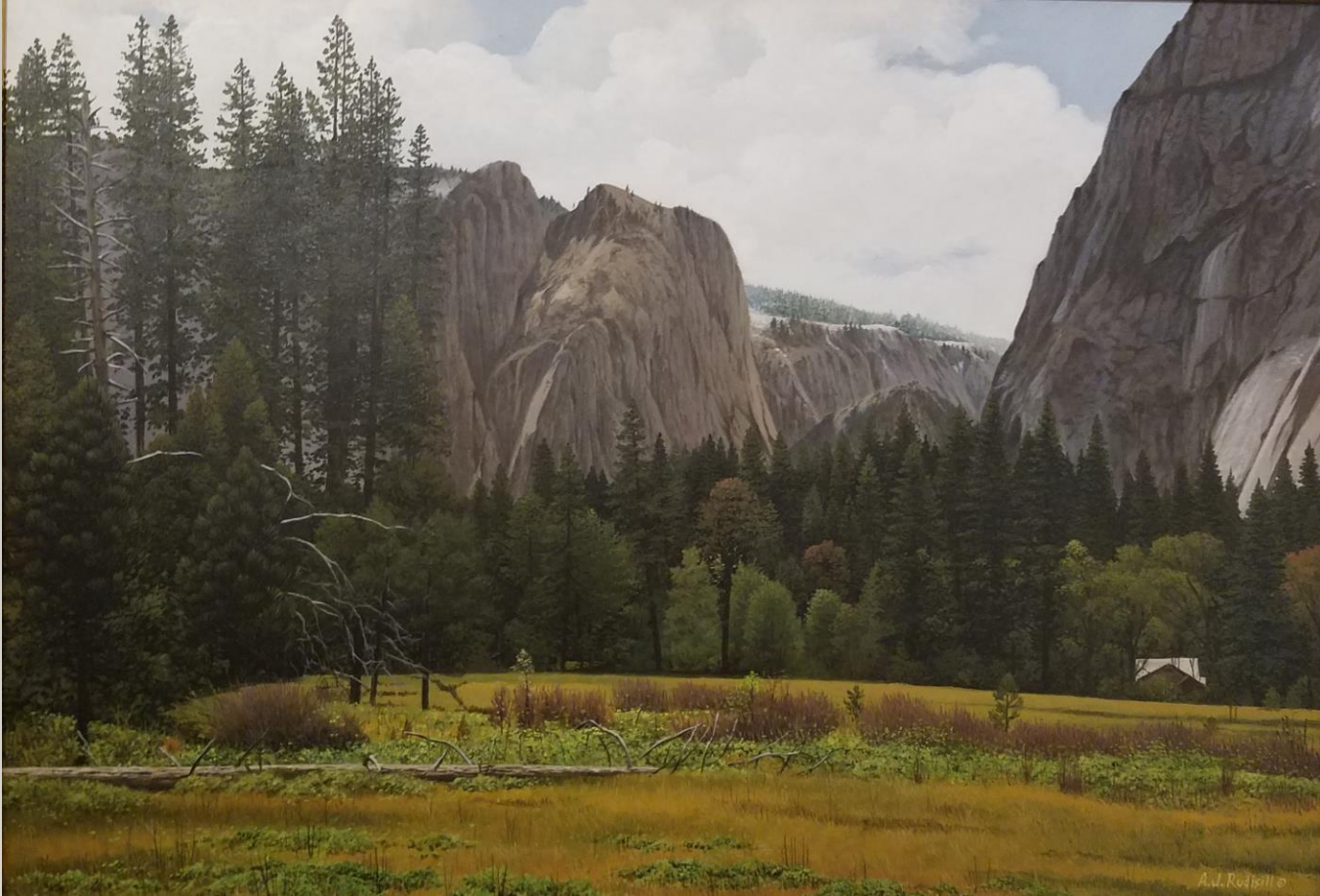
A.J. Rudisill Cook's Meadow/Yosemite Acrylic on panel 18" x 26"