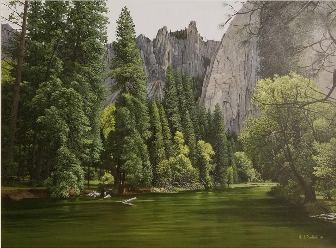
A.J. Rudisill Cathedral Spires/ Merced/ Yosemite Acrylic on panel 18" x 24"