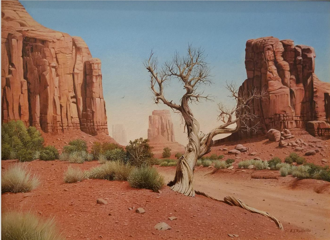
A.J. Rudisill Twisted Tree/ Monument Valley AZ Acrylic on panel 18" x 24"