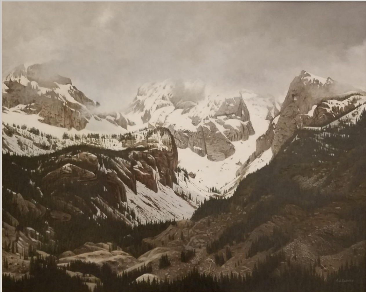
A.J. Rudisill The Grand Tetons Acrylic on panel 24" x 30"