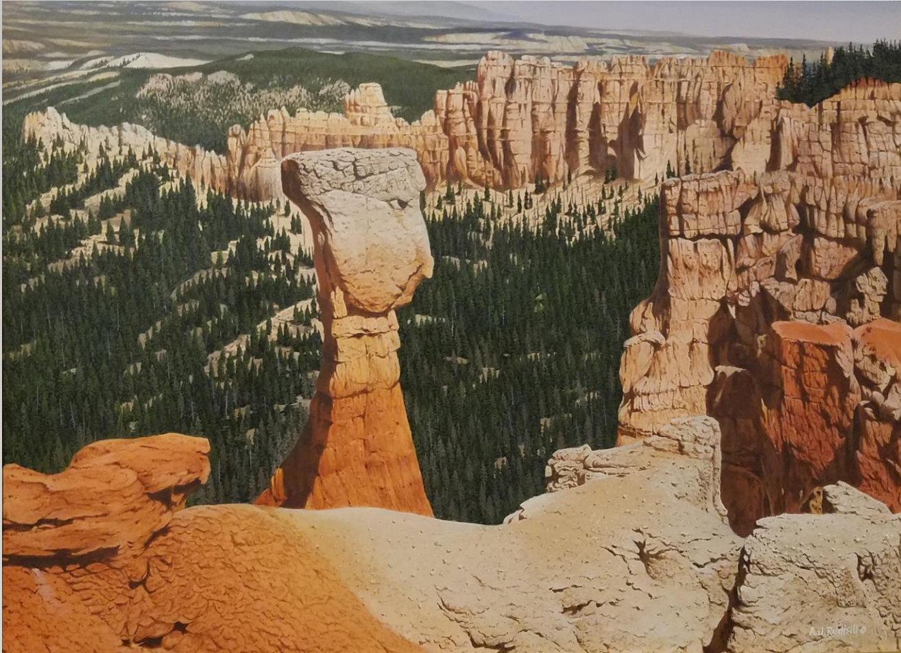
A.J. Rudisill The Hunter/ Bryce Canyon Acrylic on panel 18" x 24"