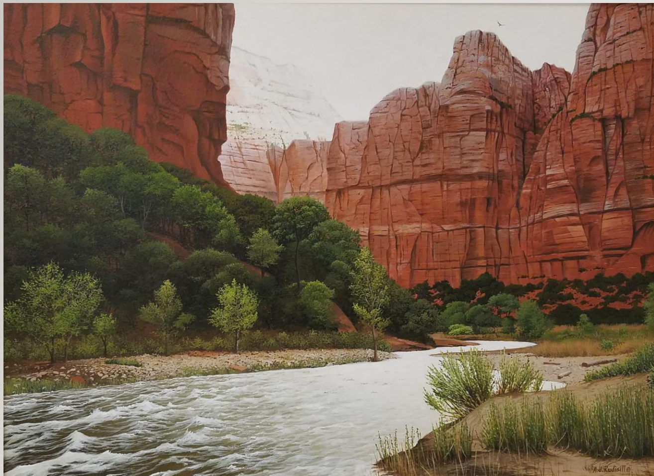
A.J. Rudisill The Virgin River/ Zion National Park UT Acrylic on panel 18" x 24"