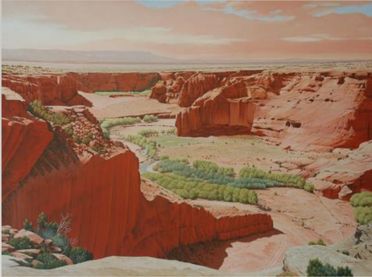
A.J. Rudisill Canyon de Chelly National Park AZ Acrylic on panel 30" x 40"