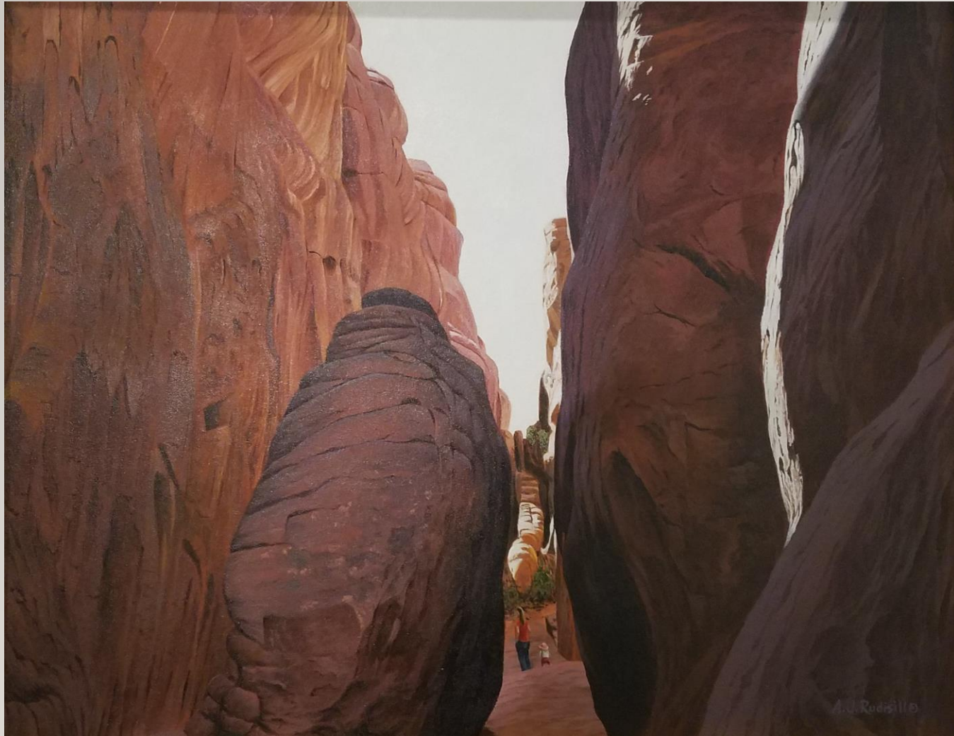
A.J. Rudisill Sand Dune Arch Trail/ Arches National Park UT Acrylic on panel 16" x 20"