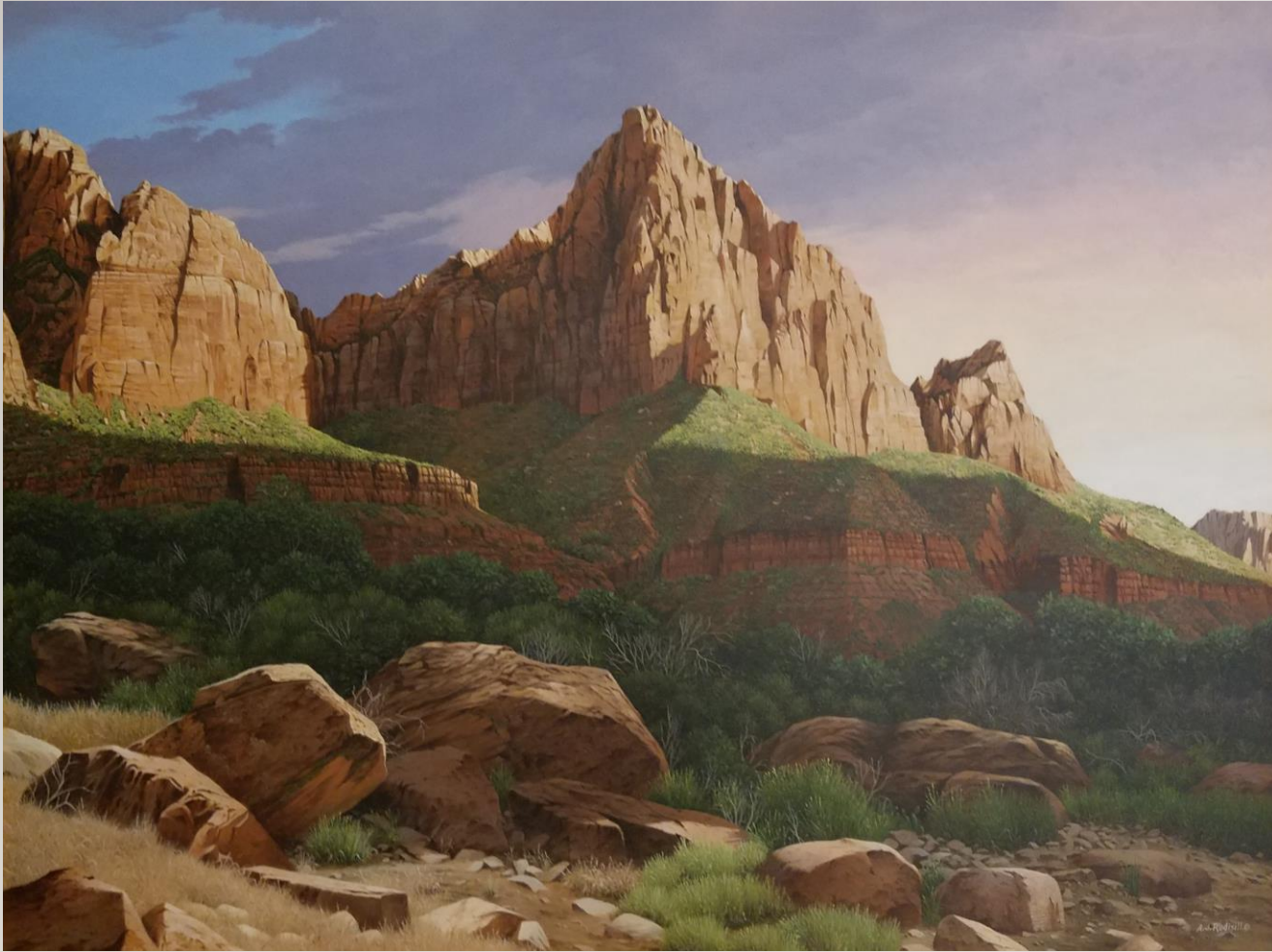
A.J. Rudisill The Watchman/ Zion National Park UT Acrylic on panel 30" x 40"