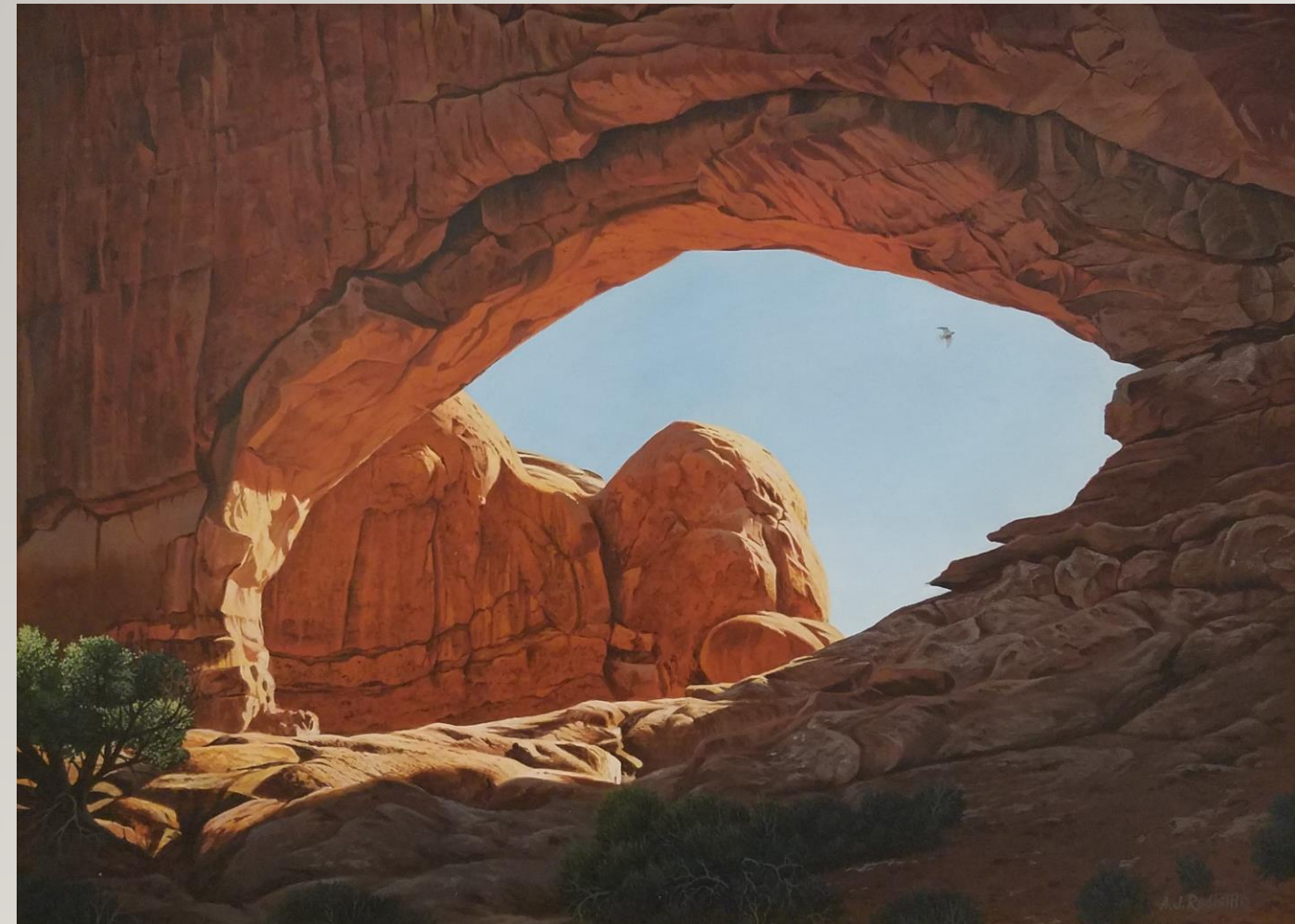
A.J. Rudisill The North Window/ Arches National Park UT Acrylic on panel 18" x 24"