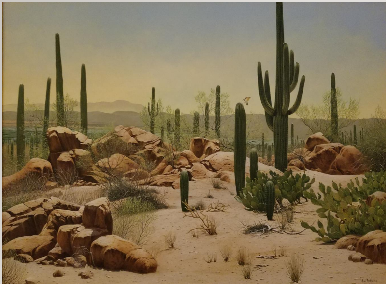
A.J. Rudisill Saguaro National Park AZ Acrylic on panel 30" x 40"