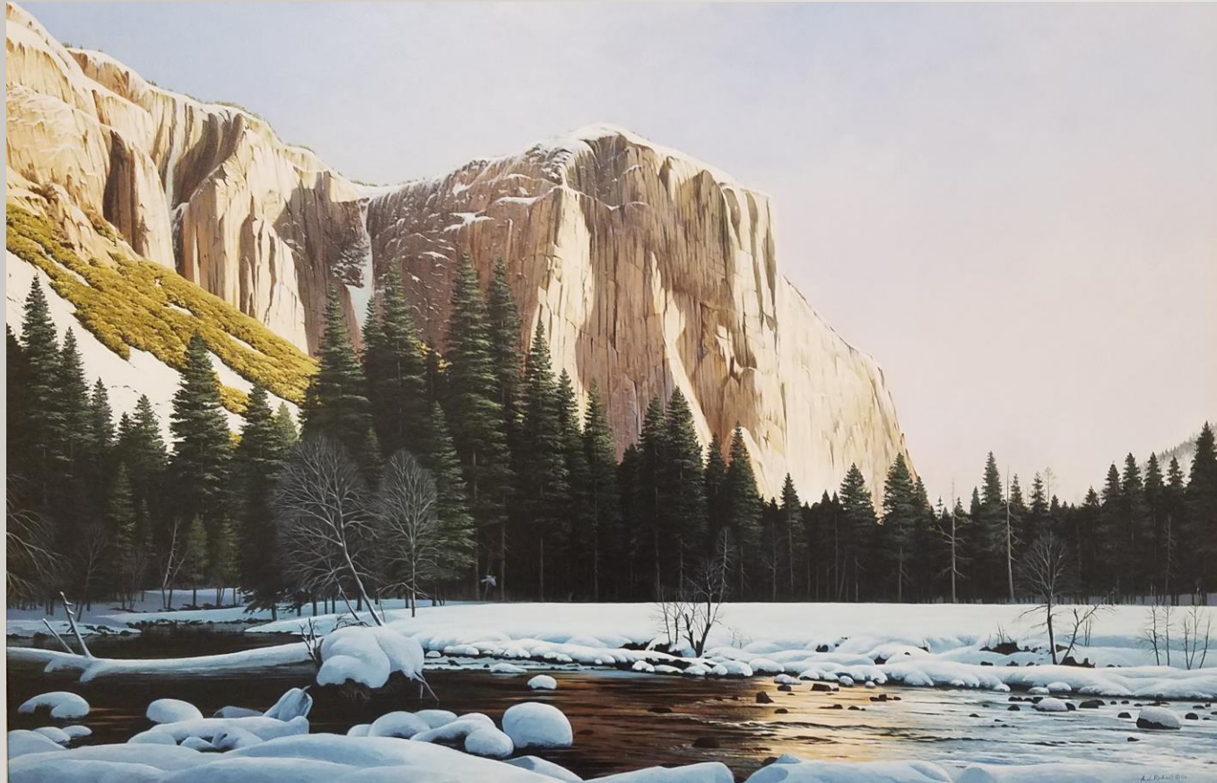
A.J. Rudisill El Capitan/ Yosemite National Park CA Acrylic on panel 20" x 30"