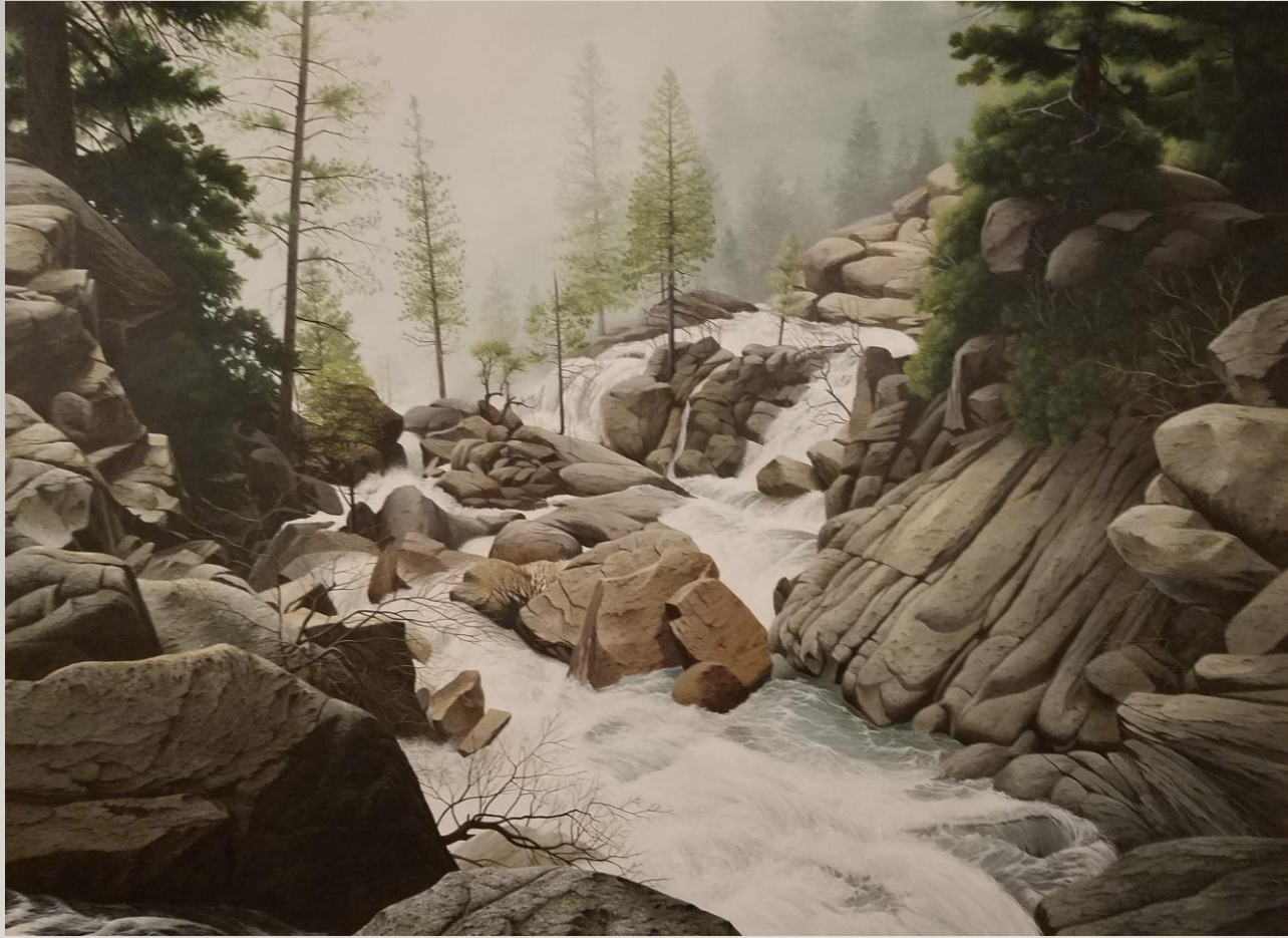
A.J. Rudisill Spring Thaw/ Cascade Creek/ Yosemite National Park CA Acrylic on panel 30" x 40"