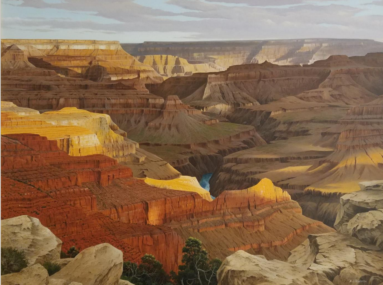
A.J. Rudisill Hopi Point Sunrise/ Grand Canyon AZ Acrylic on panel 30" x 40"