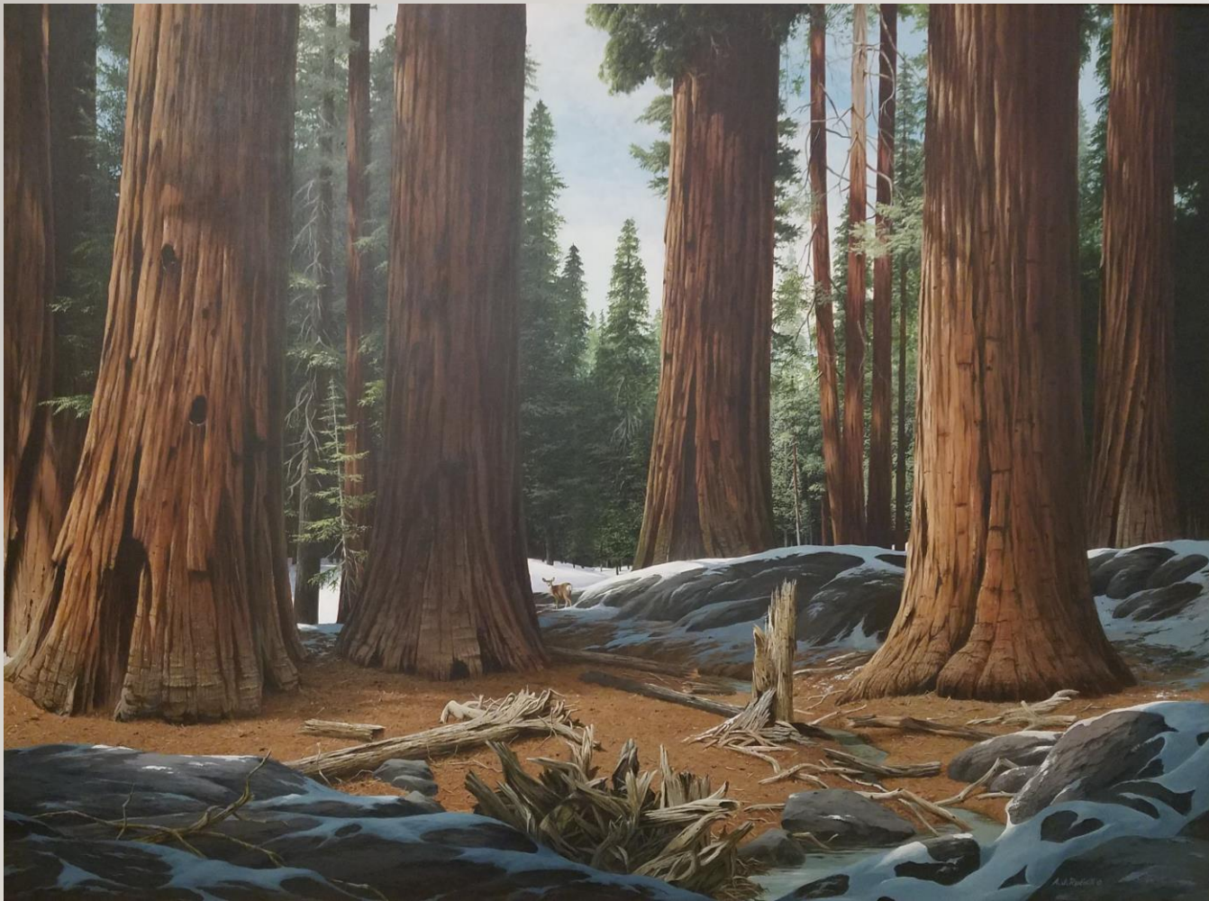
A.J. Rudisill The Giant Sequoias/ Sequoia National Park CA Acrylic on panel 22" x 33"