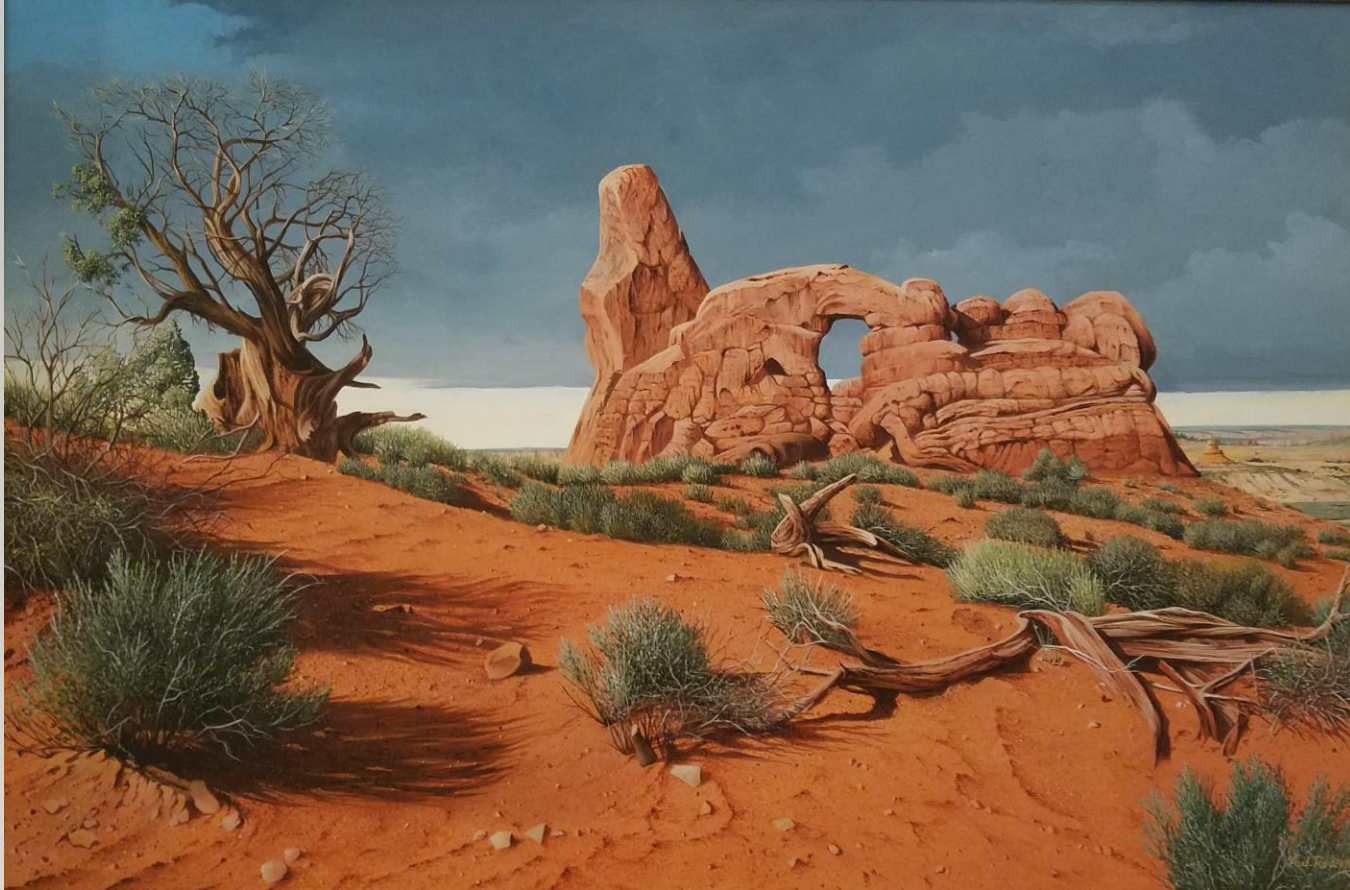
A.J. Rudisill Delicate Arch Acrylic on panel 22" x 33"