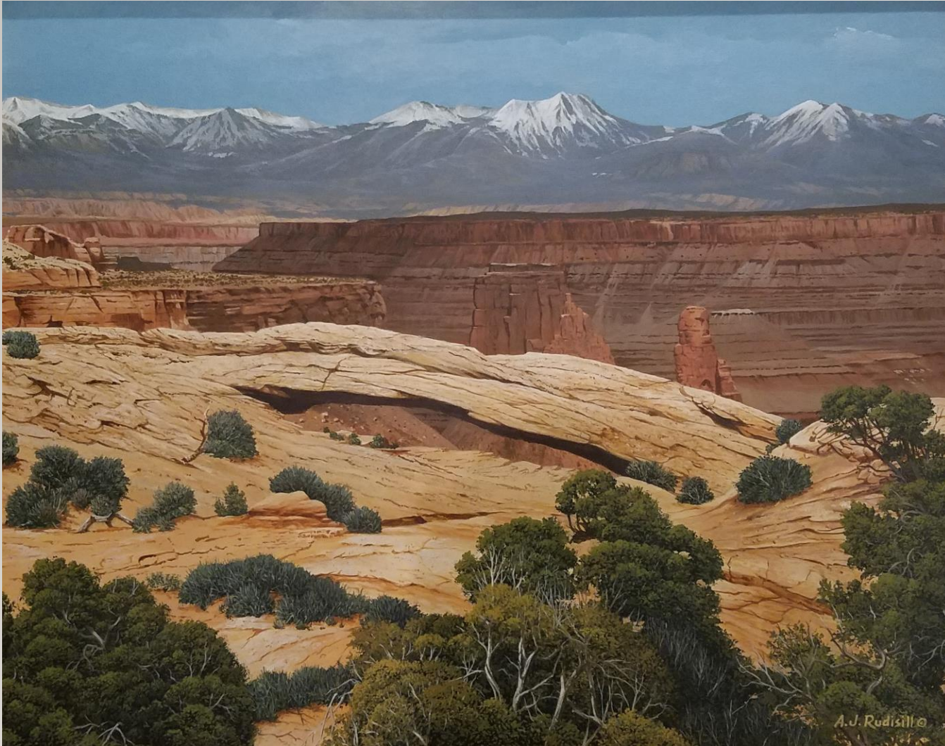
A.J. Rudisill Mesa Arch/ Canyonlands National Park UT Acrylic on panel 16" x 20"