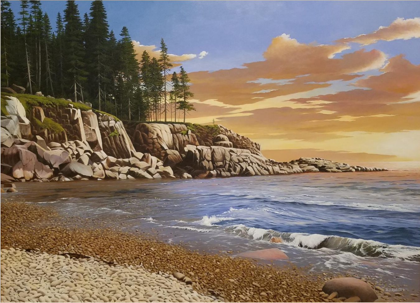
A.J. Rudisill Acadia Sunrise Acrylic on panel 30" x 40"