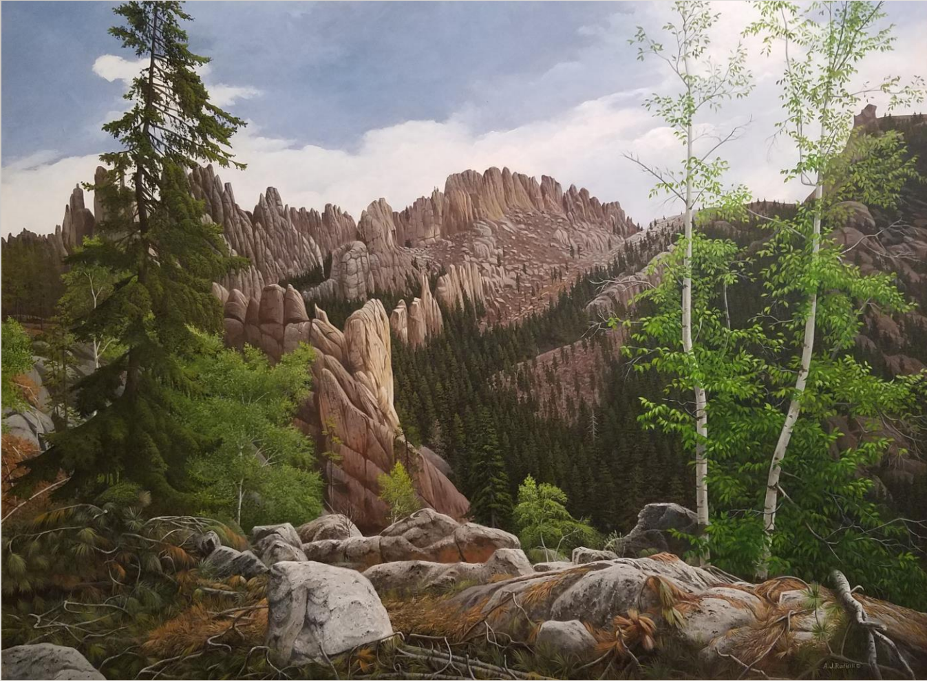
A.J. Rudisill Cathedral Spires Trail Head Acrylic on panel 30" x 40"