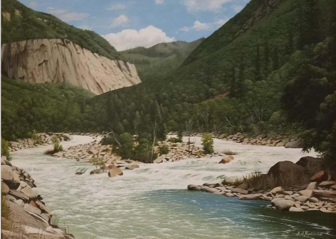
A.J. Rudisill The Kaweah River/ Sequoia National Park CA Acrylic on panel 18" x 24"