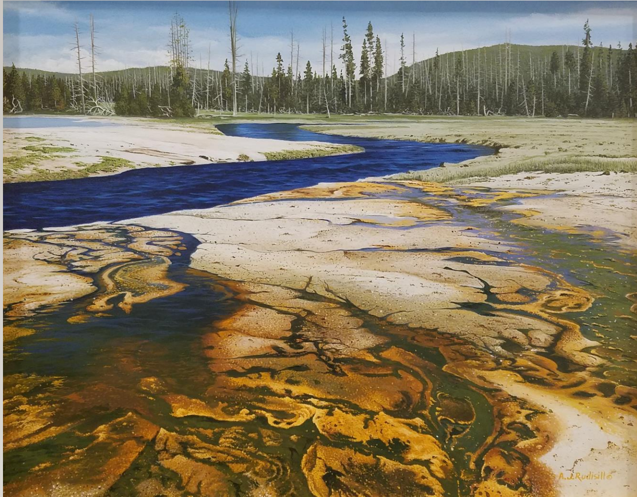
A.J. Rudisill Black Sand Basin/ Yellowstone National Park WY Acrylic on panel 16" x 20"