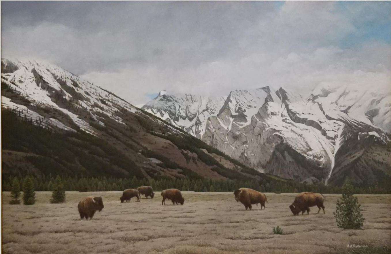
A.J. Rudisill Tetons Bison Acrylic on panel 20" x 30"