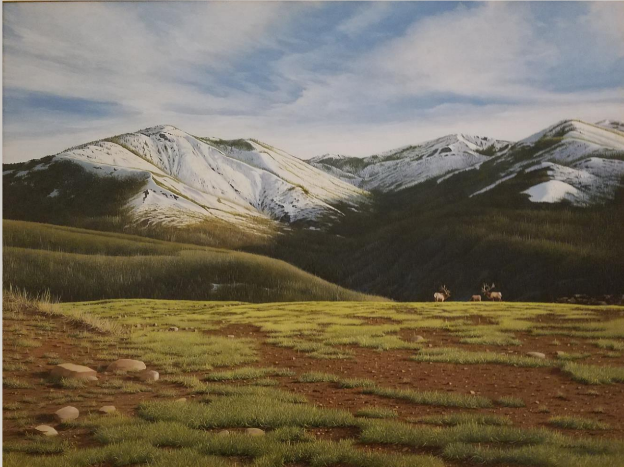
A.J. Rudisill Yellowstone National Park WY Acrylic on panel 16" x 20"