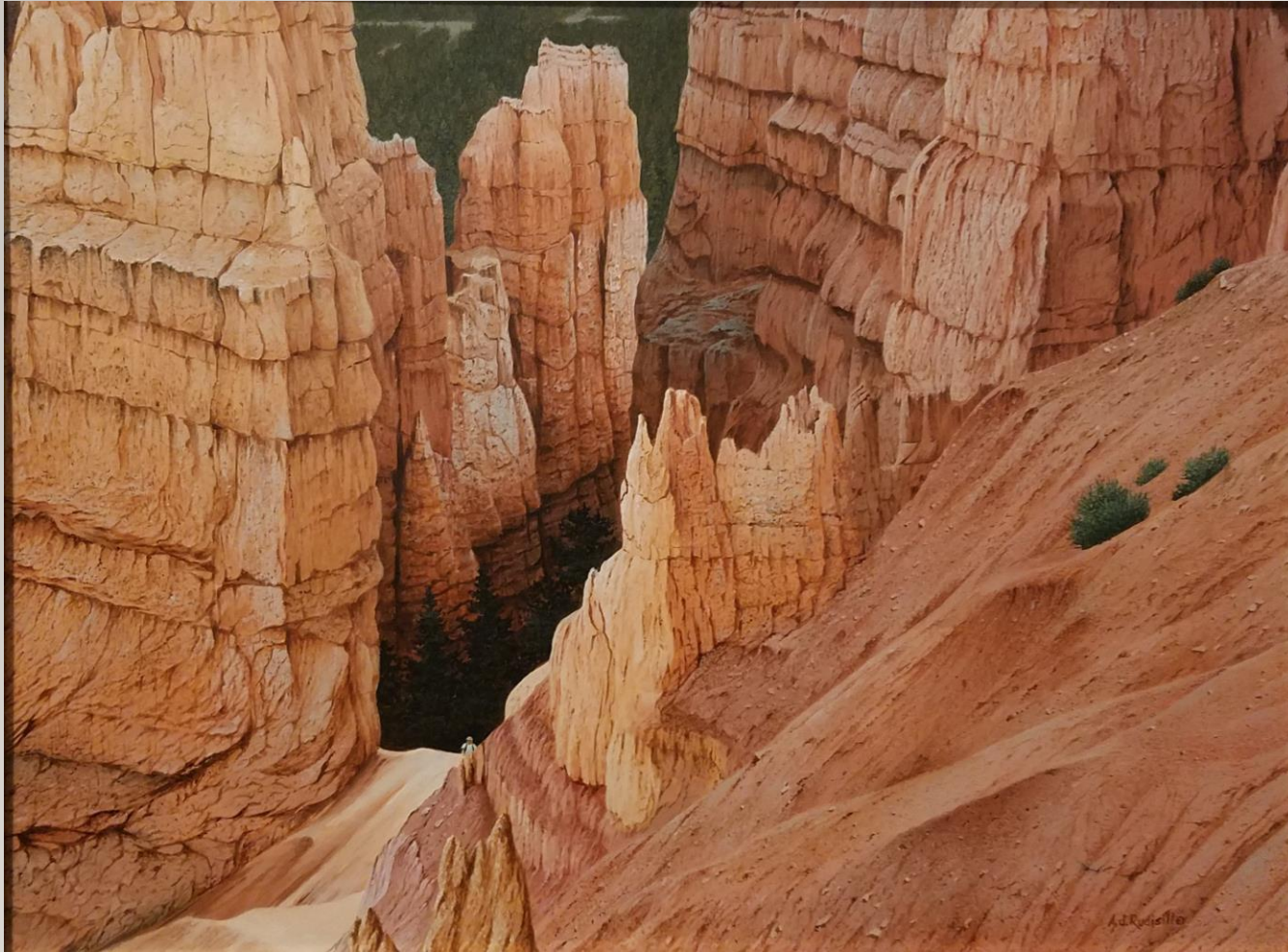
A.J. Rudisill Navajo Loop Trail Acrylic on panel 18" x 24"