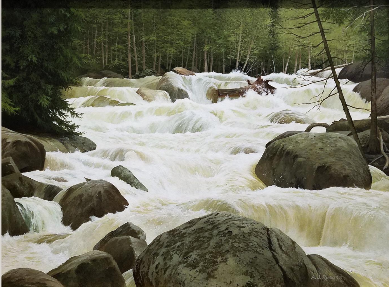
A.J. Rudisill The Yellowstone River Acrylic on panel 18" x 24"