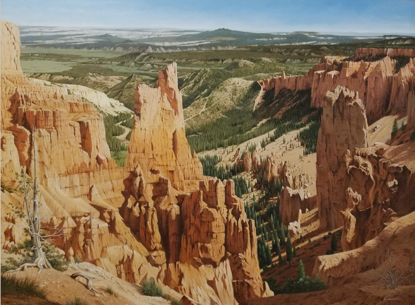
A.J. Rudisill Bryce Canyon National Park UT Acrylic on panel 30" x 40"