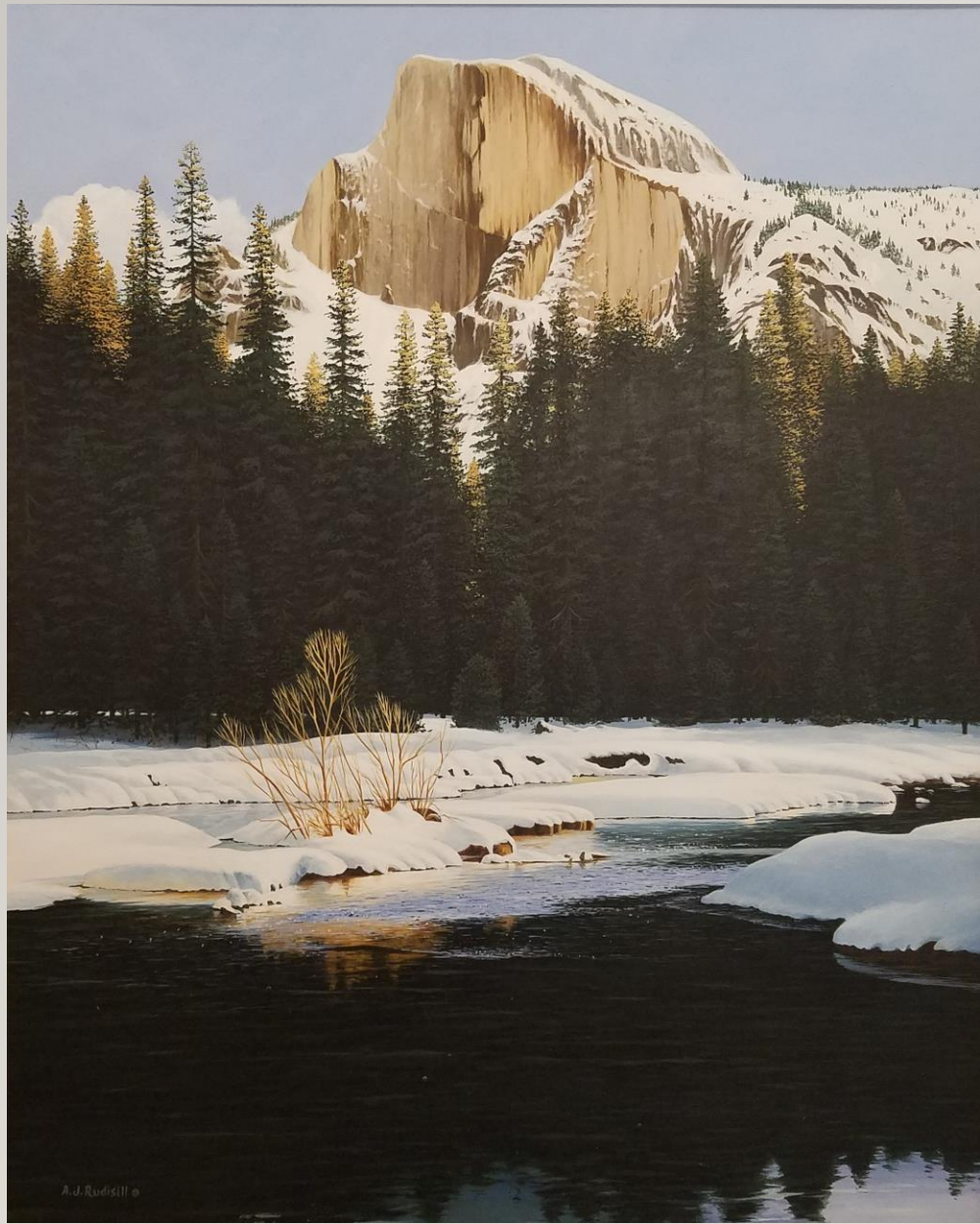
A.J. Rudisill Half Dome Acrylic on panel 30" x 24"