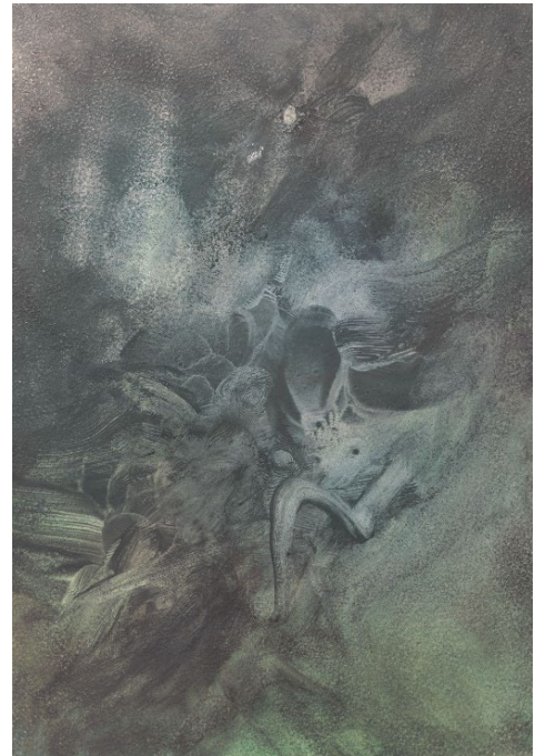
Joe Lugara, No. 1 (Scrutiny Series) , watercolor